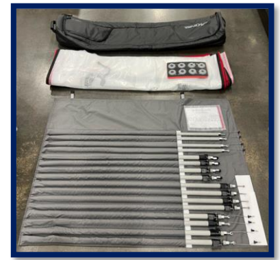
One-Person Portable DIRT Bag® Kit