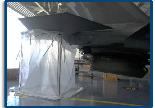
Unique Working Environments